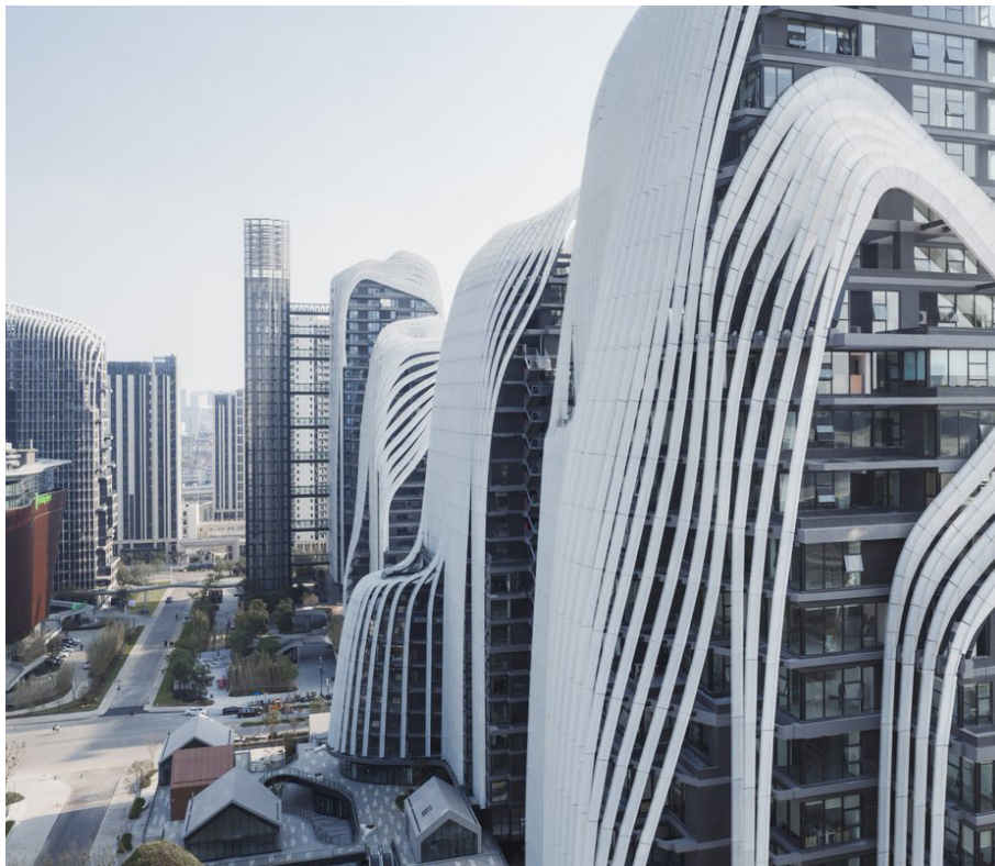
Nanjing Zendai Himalayas Center - Nanjing, China